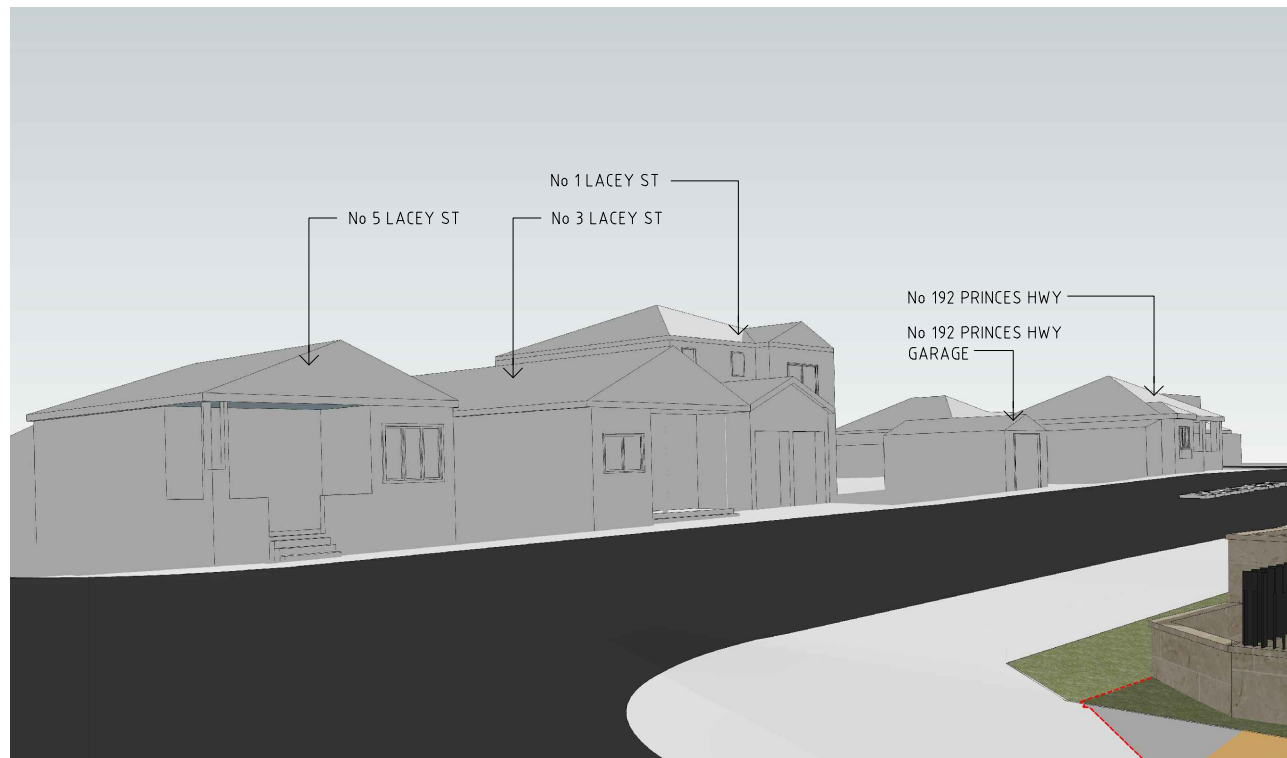
3 21ST DECEMBER - 3PM NTS

LEGEND OUTLINE OF SHADOW CAST BY PROPOSED DEVELOPMENT SHADOW CAST BY COMPLIANT BUILDINGS SHADOW CAST BY EXISTING BUILDINGS